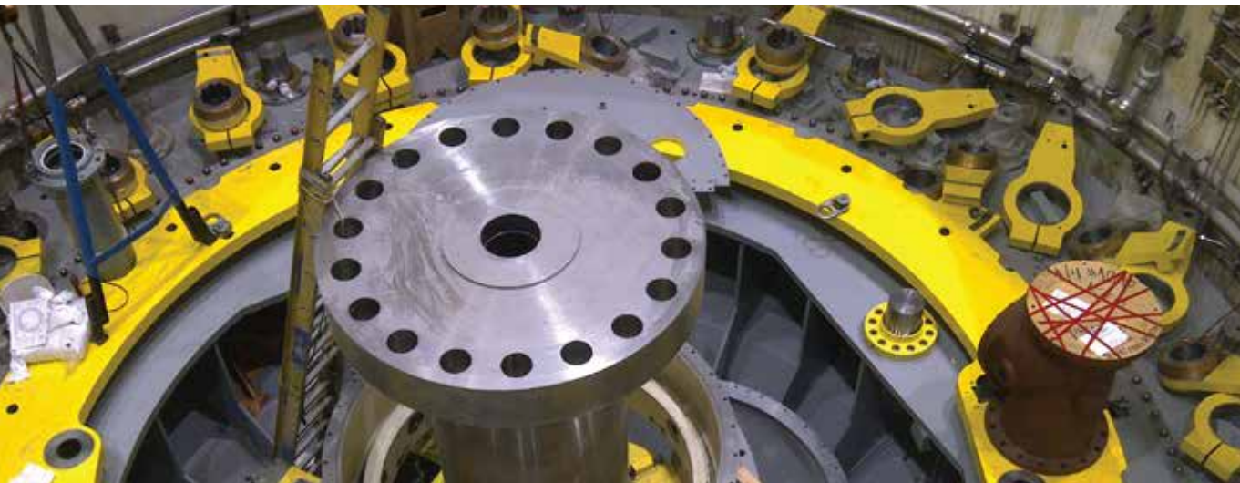
Hydro Electric Unit