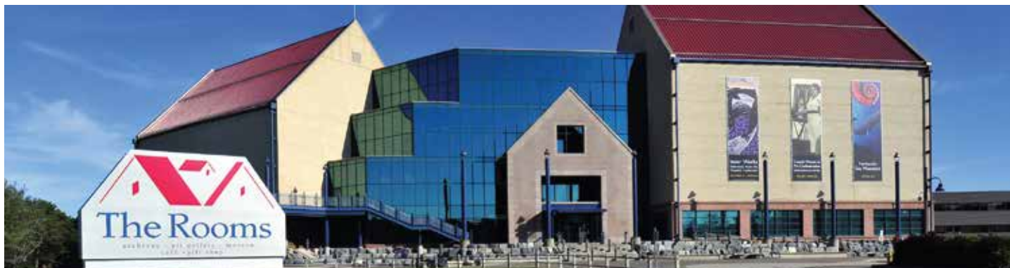
The Rooms, Newfoundland and Labrador's largest public cultural space

Integration of work scopes for different disciplines allows for safe management of complex, time-sensitive projects, resulting in maximum efficiency and productivity.